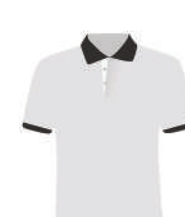
WHITE MELANGE + NAVY BLUE