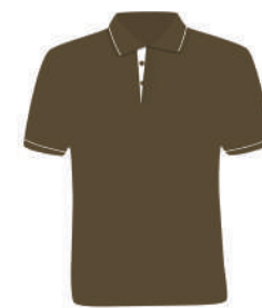
MILITARY GREEN + WHITE