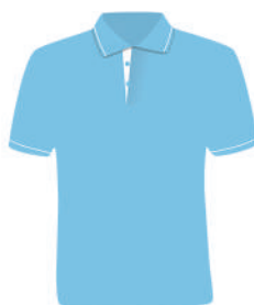
TURQUOISE GREEN + WHITE