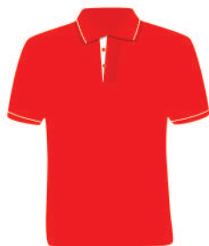
RED + WHITE