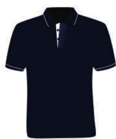
NAVY BLUE + WHITE