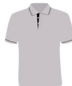
MELANGE + BLACK