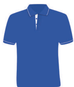
ROYAL BLUE + WHITE

S - 38 inches | M- 40 inches | L - 42 inches | XL - 44 inches | XXL - 46 inches