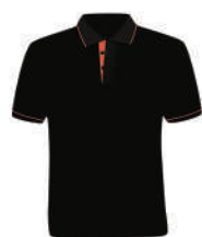
BLACK + RED