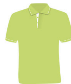
APPLE GREEN + WHITE