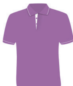
PURPLE + WHITE