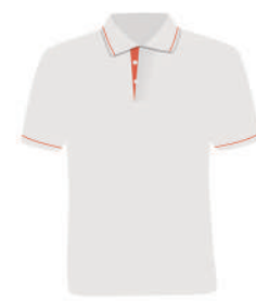
WHITE + RED