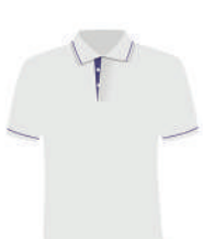
WHITE + ROYAL BLUE