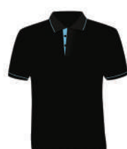
BLACK + BLUE