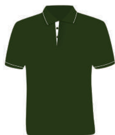
BOTTLE GREEN + WHITE